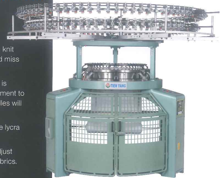
* Machine photo includes optional items